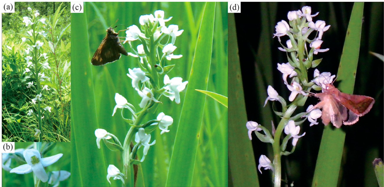
Figure 1. (a) Platanthera hologlottis in the wild, (b) an enlarged photograph of P. hologlottis flower, (c) a visiting species of Ochlodes ohraceus in the day, (d) a visiting species of Plussiinae in the night.

pollination syndrome (Fægri and van der Pijl 1971; Fenster et al. 2004). Thus, flower morphology may imply that P. hologlottis flowers are ecologically specialized for moth pollination. However, it has been previously reported that pollen vectors of P. hologlottis were by butterflies ( Ochlodes venata , Colias erate , Pieris melete ) mainly (Inoue 1983). It is therefore unclear whether the effective pollinators of P. hologlottis are diurnal flower visitors. In the present study, we hypothesized that nocturnal visitors contribute more to pollen removal and fruit production than diurnal visitors.